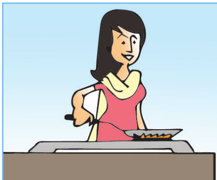
My mother is cooking food.