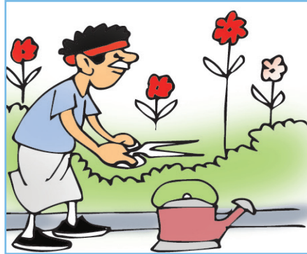
The gardener is trimming the bushes.