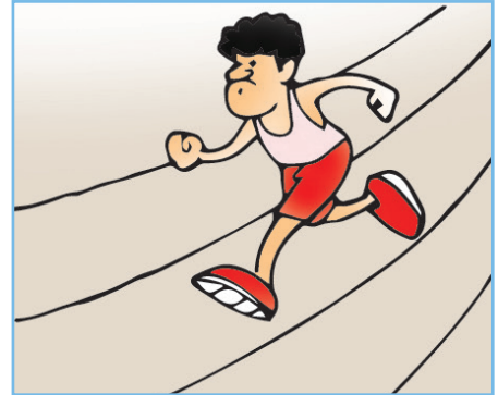
A runner is running on the tracks.